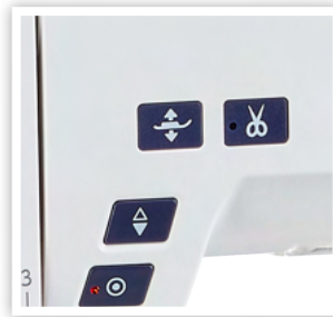
AUTOMATIC PRESSER FOOT LIFT