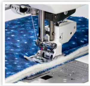
ACUFEED FLEX FABRIC FEEDING SYSTEM