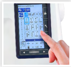
TOUCH SCREEN WITH 13 LANGUAGES