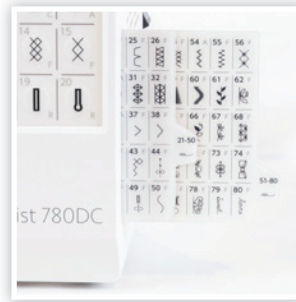
QUICK REFERENCE STITCH CHARTS