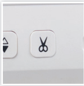
SAVE TIME WITH AUTO THREAD CUTTER