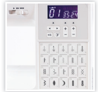
80 ESSENTIAL STITCHES FOR QUILTING AND SEWING